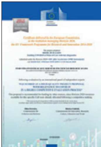
EIC Seal of Excellence